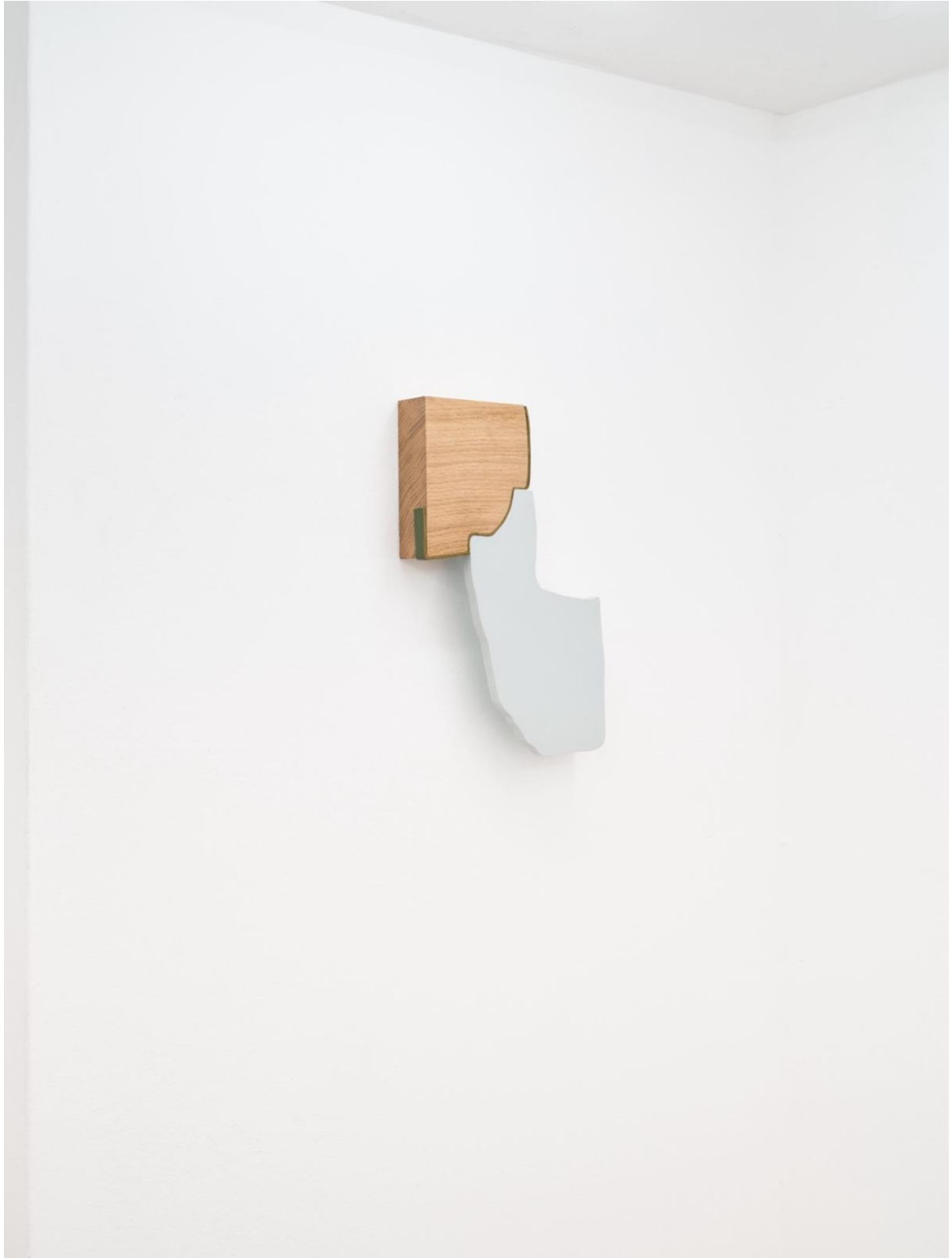
Untitled(2022) plywood, oak, leather. 36x22x5cm