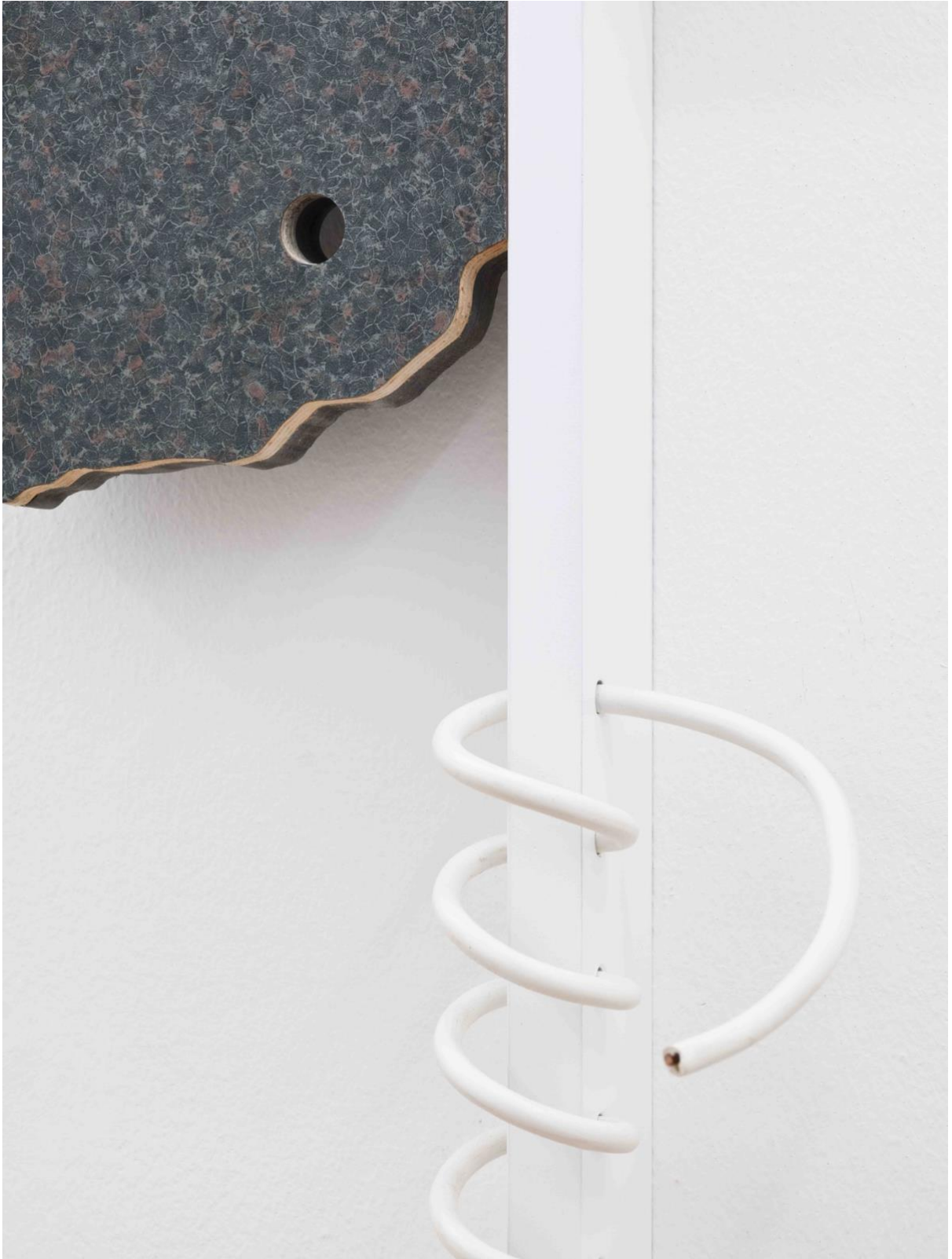
Untitled(2022) Formica, Ply, Electrical cable. 85 x 58 x 10cm